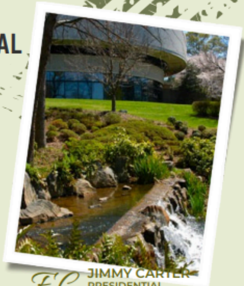
F.C. JIMMY CARTER PRESIDENTIAL LIBRARY & MUSEUM

4 persons per room $885.00 per person 3 persons per room $990.00 per person 2 persons per room $1,200.00 per person Single Room $1,830.00 per person